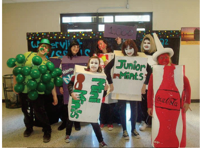
The Odyssey of the Mind team prepares for the competition